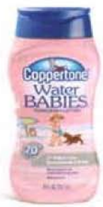
Coppertone Water Babies pure and simple in 70+ SPF. $10, major retailers.