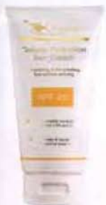
The Organic Pharmacy cellular protection products are trusted to be clean. $58. The Organic Pharmacy, 435 North Beverly Drive, Beverly Hills (visit on Wednesday mornings for topical parent discussions) or theorganicpharmacy.com .