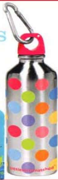
Zany dots on steel. $15. littlemissmismatched.com