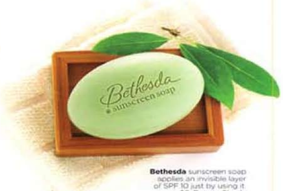
Bethesda sunscreen soap applies an invisible layer of SPF 10 just by using it. $8. Beauty Shack, The Pharmacy Venice or bethesdashincare.com .