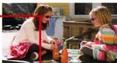
MF Eyewear offers 100% UVA/UVB impact-resistant sunshades with a neoprene band. $15+. mfeyewear.com .