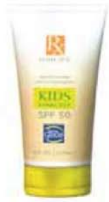
Rx Suncare Kids Sunblock, SPF 50, is one of the new Rx Suncare line. $3 to $10. Rite Aid.