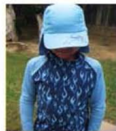
Sun Protection Zone offers long and short sleeve rash guards and provides the textile equivalent of SPF 100, starts at $24. They also make Solar Safe UV Wristbands, which are waterproof and lets you know when it's time to reapply sunscreen or seek shade. $7 for pack of 2. CVS, Rite Aid and sunprotectionzone.com .